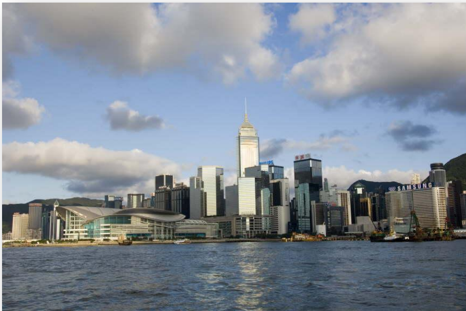
Hong Kong Skyline